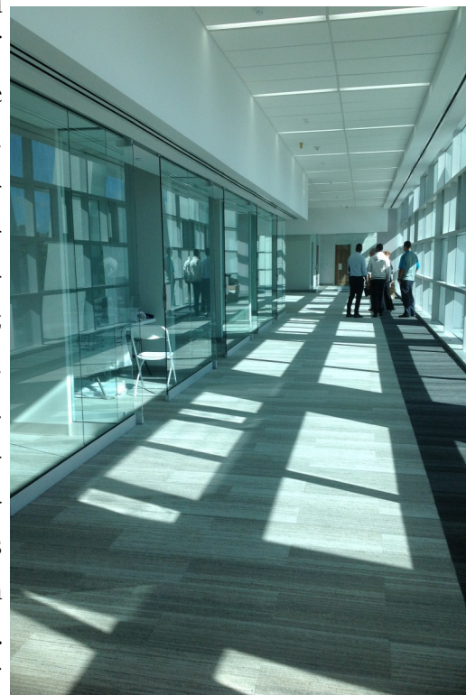
Future area of the Social Research Center